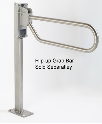
Flip-up Grab Bar Sold Separately

health at home, inc. Enhancing Safety, Vitality & Longevity at Home